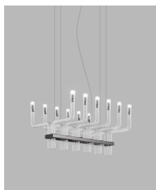
STRDU SP R