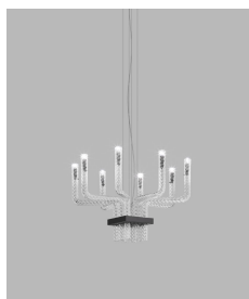
STRDU SP Q