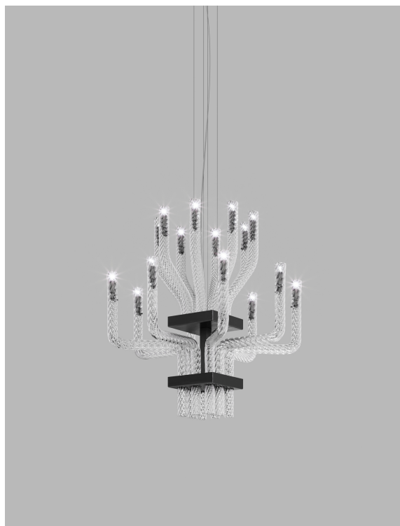
STRDU SP DOP CRRI NN G9 CE